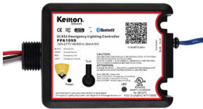
PPA109S.B1 Emergency Lighting Controller UL924 Emergency Lighting Controller