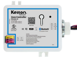
PPA104S.B1 Zone Controller Line Voltage 20A Bluetooth Zone Controller