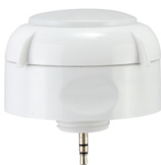
EFS106-AUX.B1 High Bay Sensor Plug and Play High Bay Sensor