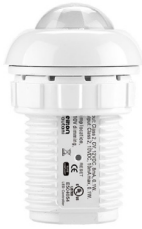
IFS105SE.B1 Integrated Sensor Integrated Round 12V Sensor