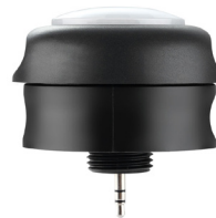
EFS106-AUX-W.B2 High Bay Long- Range Sensor Plug and Play High Bay Sensors with Long- Range Antenna for Outdoor