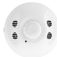
EFS107E.A0 Eco Sensor 12V Dual-Tech Ceiling Eco Sensor