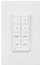
WP1018.A0 Wall Switch 8-Key Battery-Powered Bluetooth Wall Switch

To explore our complete range of TAA-compliant products and stay updated on the latest innovations, visit us at www.LiteTrace.com