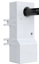
CR05.A0 Bluetooth Interface Bluetooth Interface for integrating Keilton+autani systems with Energy- Center by Autani