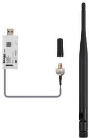
CR02-W.A0 USB Accessory Long-Range Real Time Clock USB Dongle

Explore our offering below for solutions that meet regulatory requirements while enhancing the value of your projects.