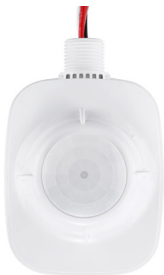
EFS104.B1 High Bay Sensor External Line Voltage High Bay Sensor (5.0 BLE)